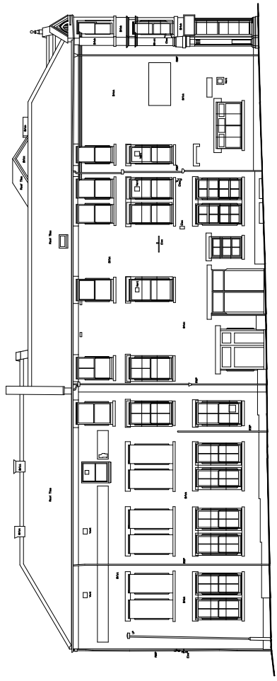
Gable Elevation as Existing Scale @ 1 : 100